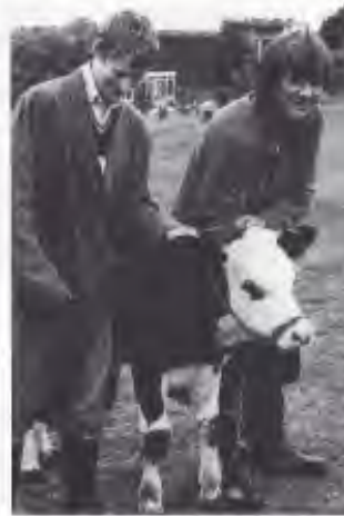
Gifts of school – and children in the good old days.

The 50th Anniversary Magazine will be available online this year.