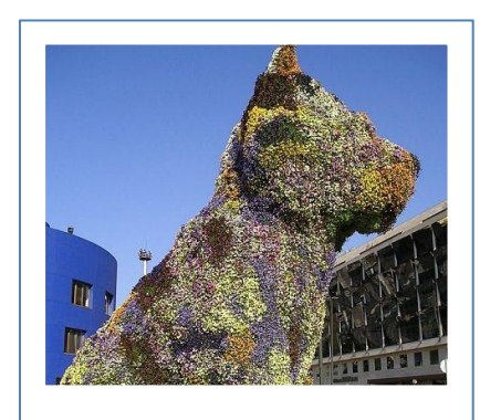
Your choice (this can be any public sculpture).