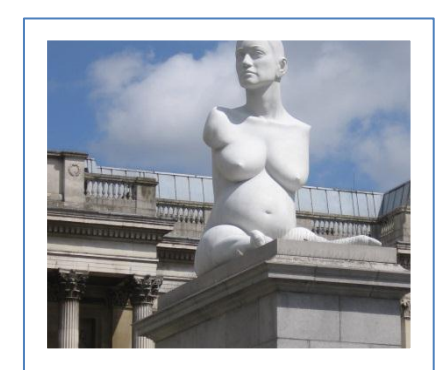
Trafalgar Square 4<sup>th</sup> Plinth Project